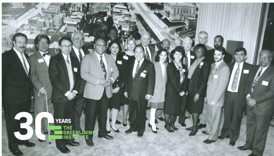
1990s Greenlining Coalition

1979 to 1980: Advocated for Executive Order requiring major utilities and telecommunications companies to report on supplier diversity – The Greenlining Coalition advocated for this policy that required the state's largest regulated utilities and telecommunications companies to annually report their percentages of contracts